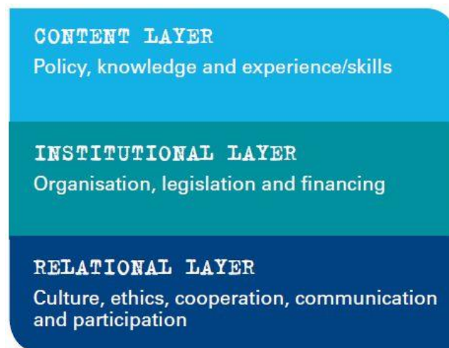
Figure 2: The Three Layer Framework

This step focusses on the governance needs of the adaptation measures. With "governance needs" the governance requirements that need to be met to be able to implement the measure are meant, such as knowledge requirements, administrative requirements and legal-operational requirements. The governance analysis is based on the three layer framework which has been developed by the Water Governance Council to assess the policy and governance situation in light of climate change adaptation.